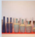
Saberan Malik Teetotaler's Recollections